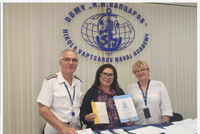
Photo Opportunity with friends/colleagues