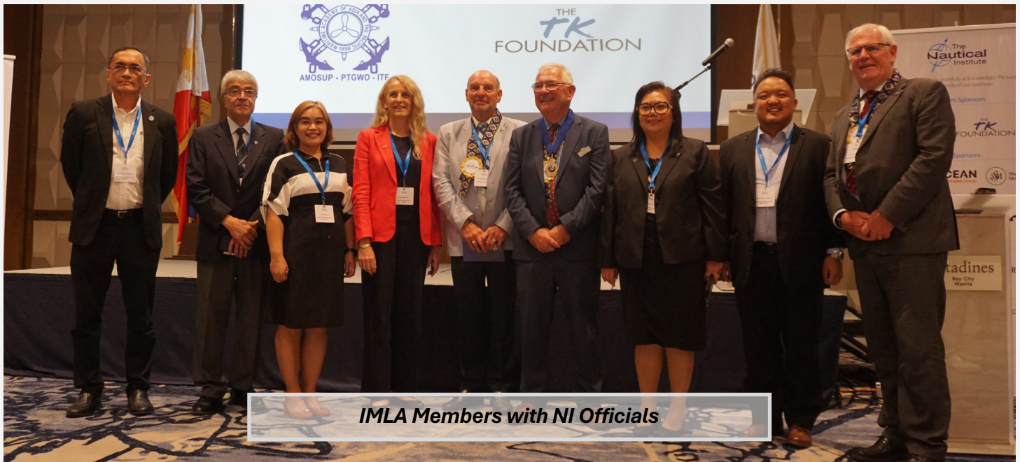
IMLA Members with NI Officials