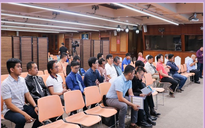
The seminar-workshop was attended by over 30 participants from various maritime institutes in the Philippines.