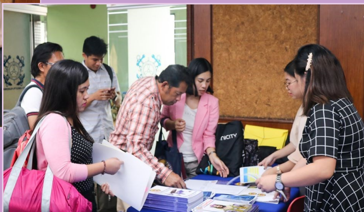
Registration of Participants