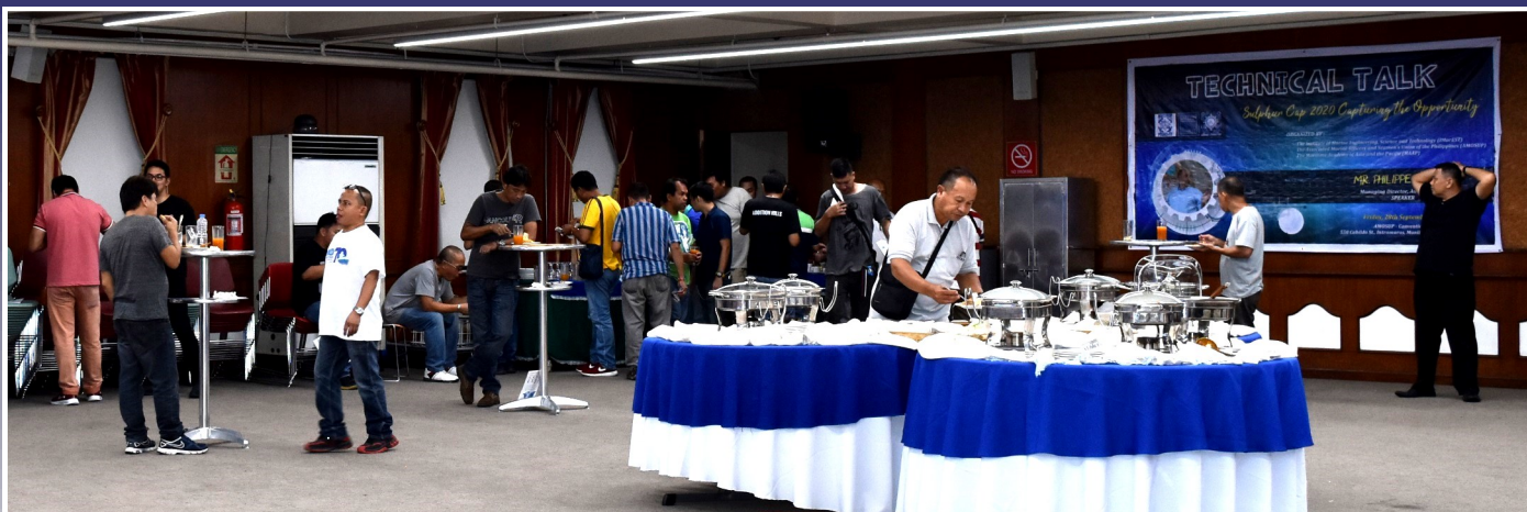
Attendees/AMOSUP/ NI/ IMAREST members who are seafarers, having their dinner before the start of the Technical Talk.