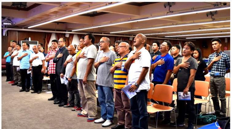
Singing of Philippine National Anthem