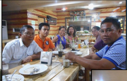
Filipino Buffet Dinner at Mt. Samat in Bataan

Photo souvenir in Pilar Balanga Bataan at the Sword of Valor Monument