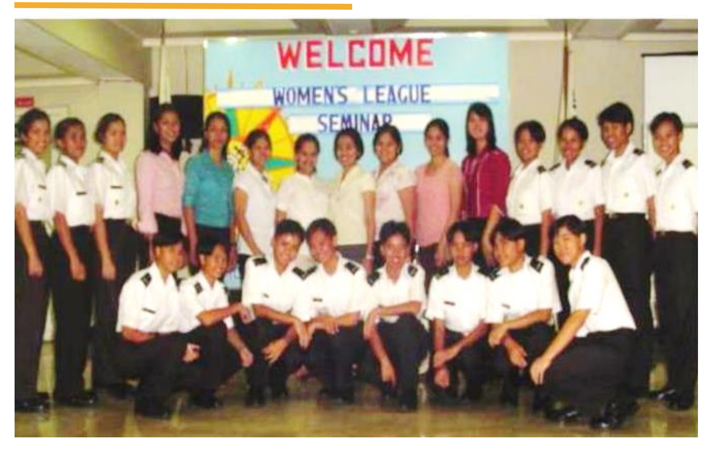
the Women's League Seminar