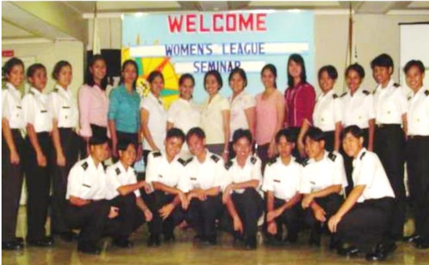
the Women's League Seminar