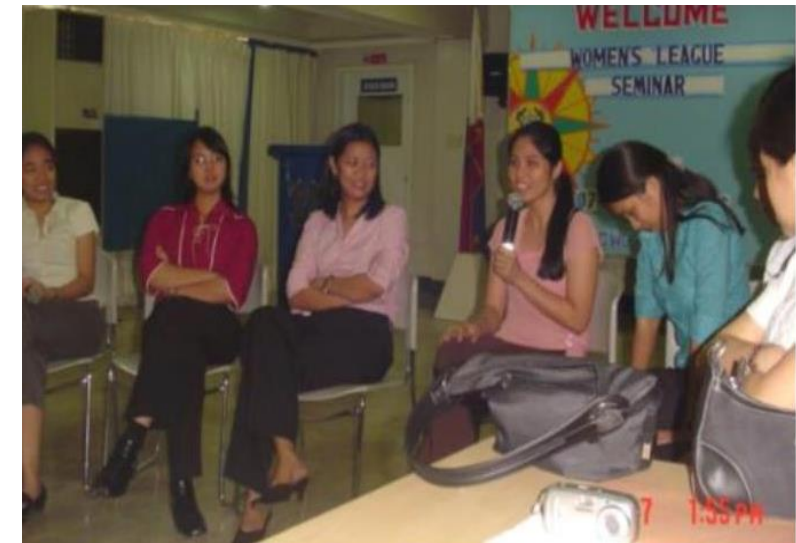
MAAP Women Alumni share their experiences as seafarers With their junior women cadets