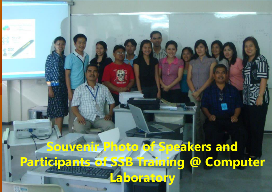
Souvenir Photo of Speakers and Participants of SSB Training @ Computer Laboratory