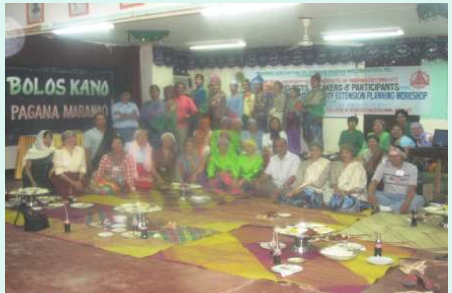
Regional Convention & Community Extension Planning Workshop September, 2007