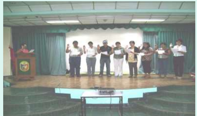
Training on Community Organization & Development May 12 – 13, 2008