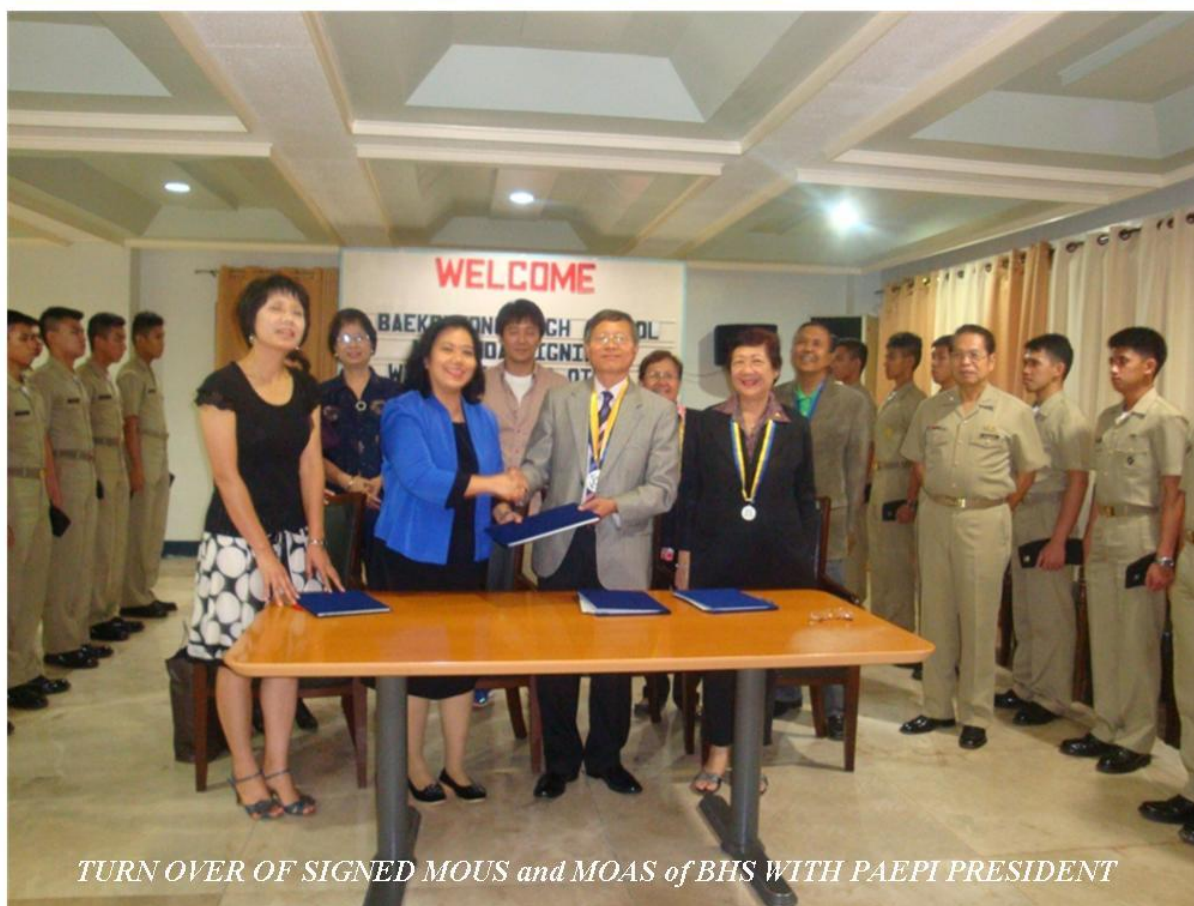
TURN OVER OF SIGNED MOUS and MOAS of BHS WITH PAEPI PRESIDENT