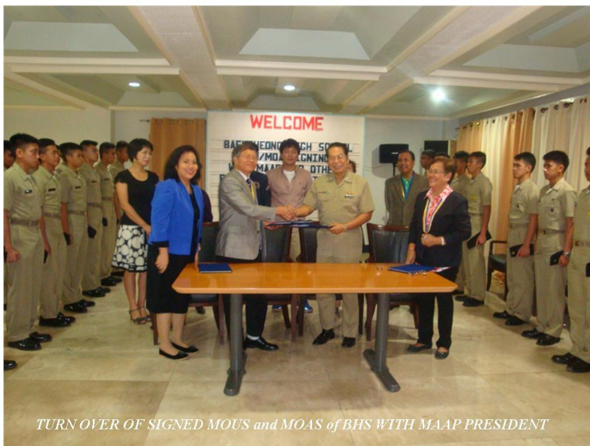
TURN OVER OF SIGNED MOUS and MOAS of BHS WITH MAAP PRESIDENT