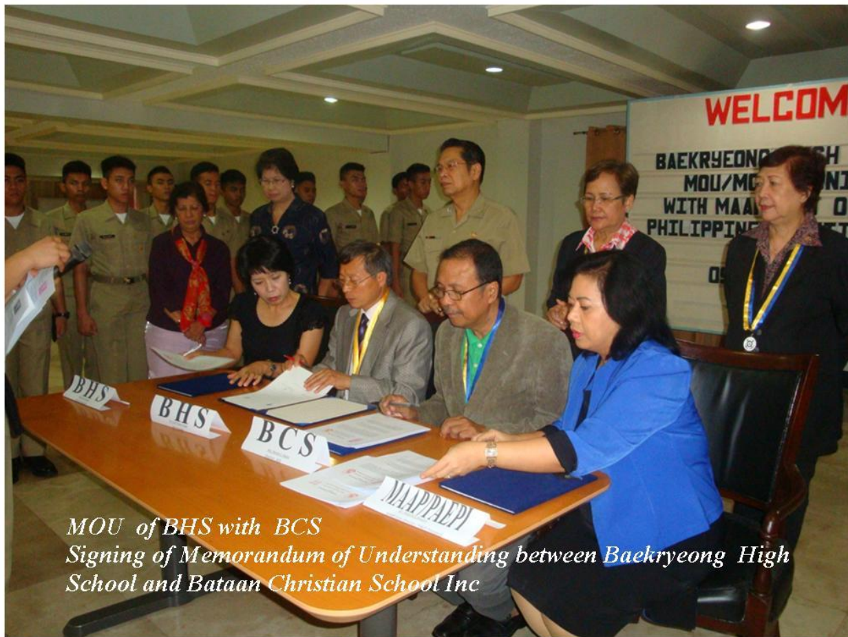
MOU of BHS with BCS Signing of Memorandum of Understanding between Baekryeong High School and Bataan Christian School Inc