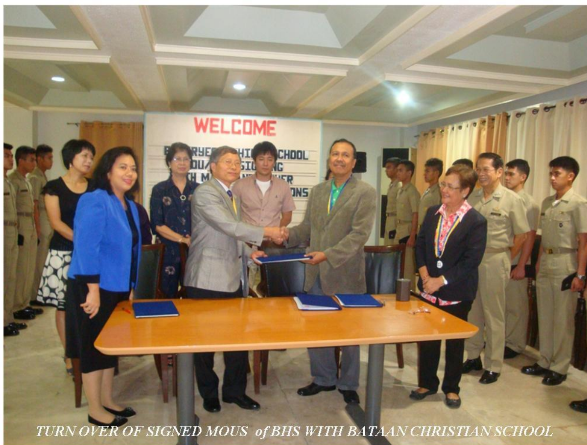
TURN OVER OF SIGNED MOUS of BHS WITH BATAAN CHRISTIAN SCHOOL