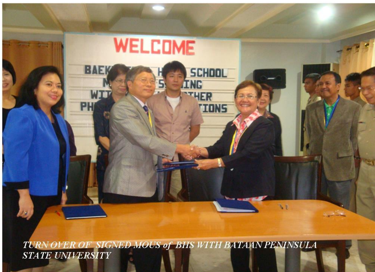
TURN OVER OF SIGNED MOUS of BHS WITH BATAAN PENINSULA STATE UNIVERSITY