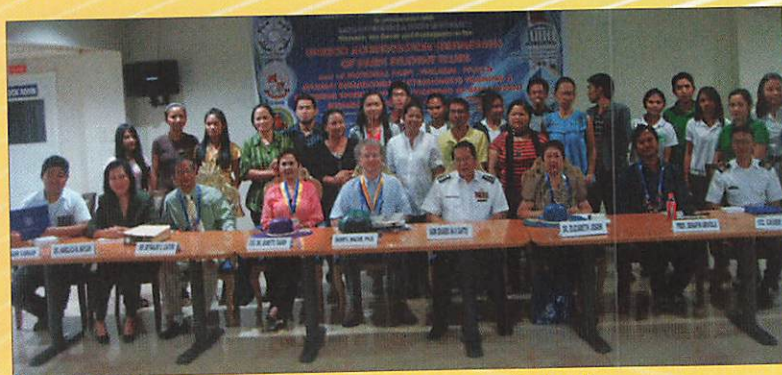
Delegates from Bataan Peninsula State University (behind).