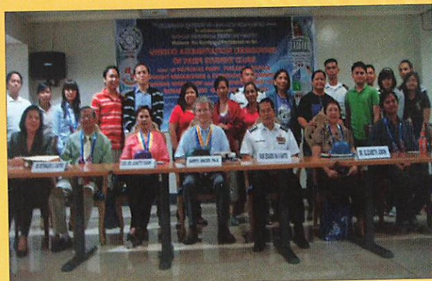
(behind) Delegates from the National Association of UNESCO Clubs in the Philippines