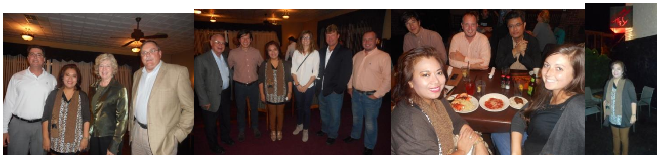
Photo souvenir at the reception Cookeville country club and then dinner at Chars.