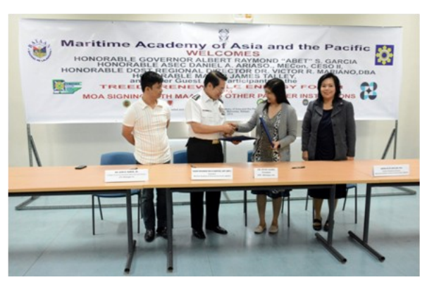
MAAP & PLP