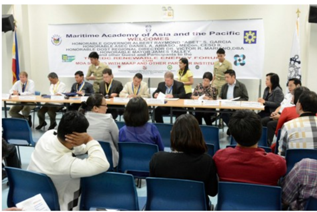
After the MOA signing were the exchange of MOAs,