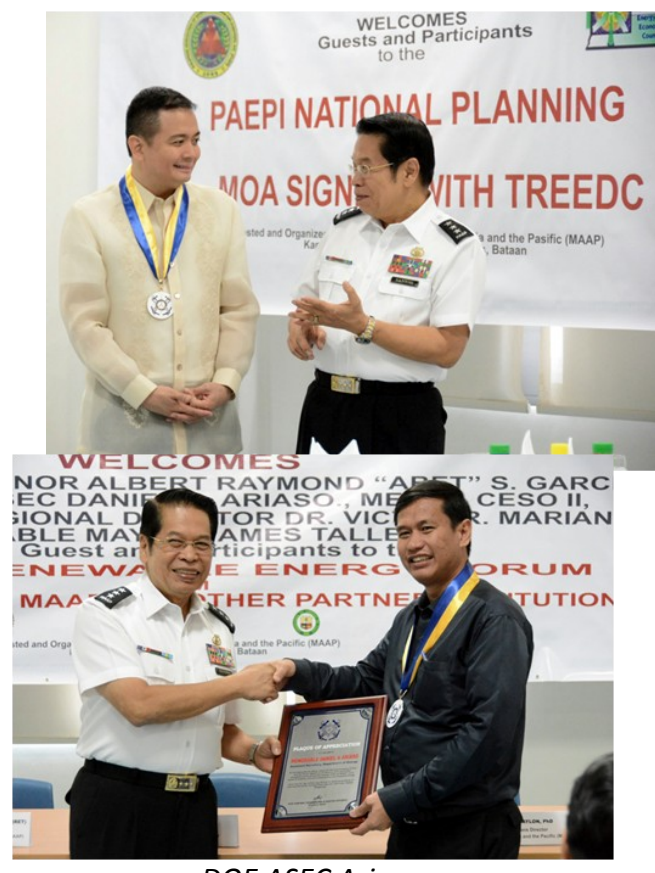
DOE ASEC Ariaso