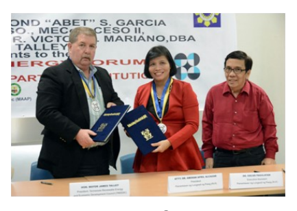
TREEDC & PLP