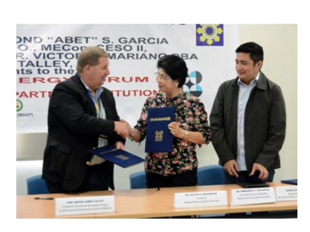
TREEDC & BPSU