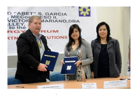
TREEDC & LPU-Batangas