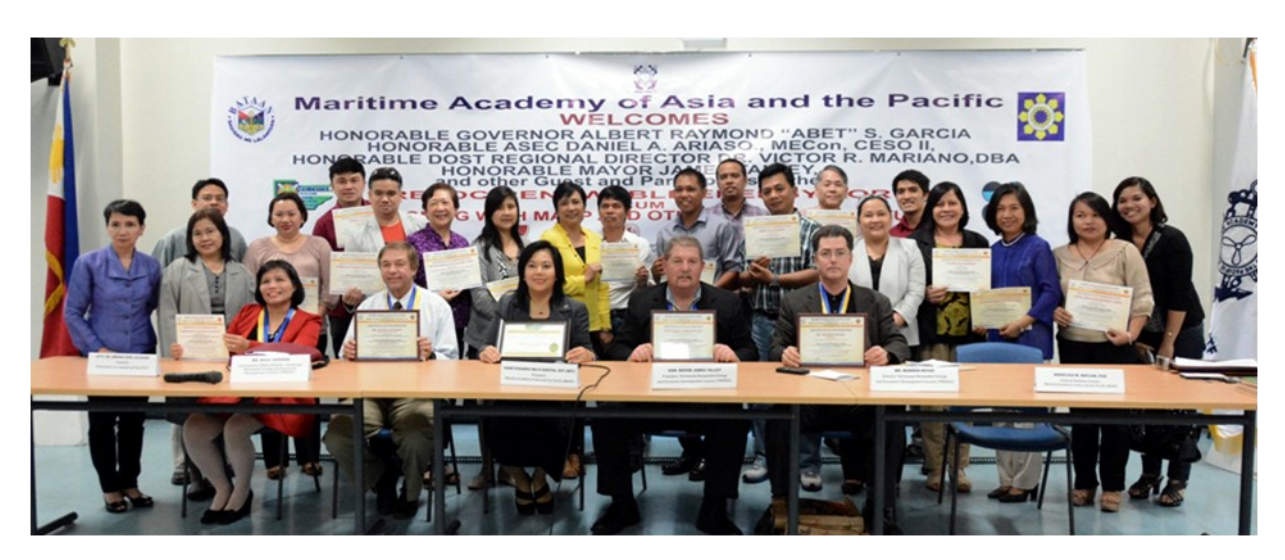
Photo souvenir of the Participants (15 HEIs) in the TREEDC Presentation Forum & PAEPI National Planning organized & initiated by MAAP, with their respective certificate of commendations for their respective institutional "invaluable support and active participation that certainly contributed to the success of the significant event which fosters international cooperation, networking and collaborative partnerships on renewable energy and environment- friendly advocacies and developments".