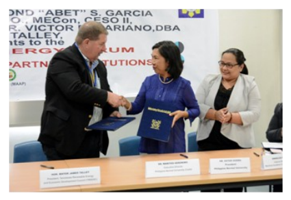
TREEDC & PNU