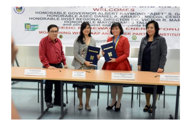
BPSU & PLP