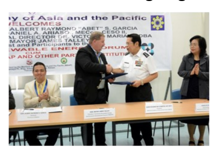
TREEDC & MAAP