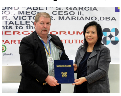
TREEDC & PAEPI