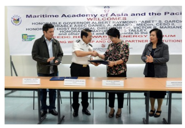
MAAP & BPSU