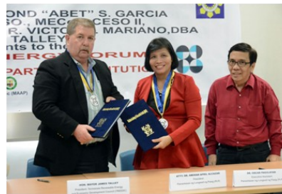
TREEDC & PLP