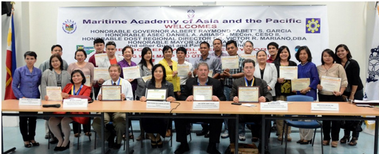
Photo souvenir of the Participants (15 HEIs) in the TREEDC Presentation Forum & PAEPI National Planning organized & initiated by MAAP, with their respective certificate of commendations for their respective institutional “invaluable support and active participation that certainly contributed to the success of the significant event which fosters international cooperation, networking and collaborative partnerships on renewable energy and environment- friendly advocacies and developments”.