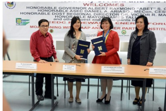
PLP & LPU-Batangas

MAAP President also awarded Plaque of Recognition to the GOH and Speakers