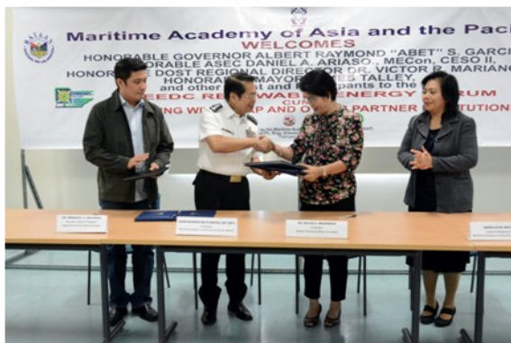
MAAP & BPSU