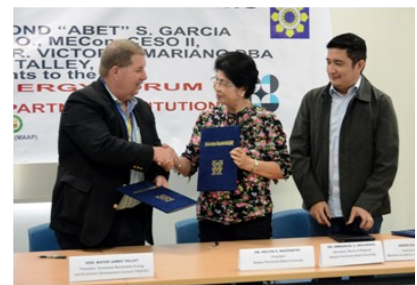
TREEDC & BPSU