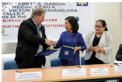
TREEDC & PNU