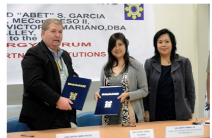
TREEDC & LPU-Batangas