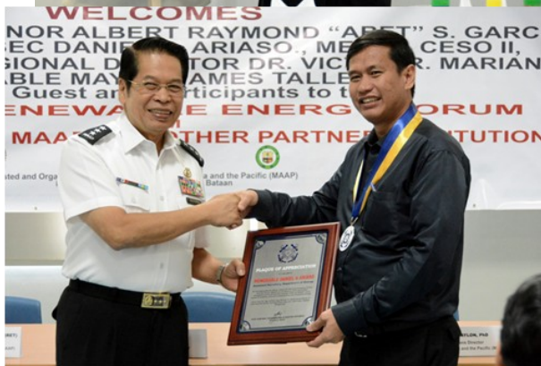
DOE ASEC Ariaso