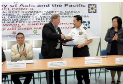
TREEDC & MAAP

After the MOA signing were the exchange of MOAs,