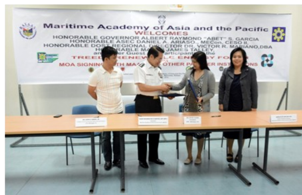
MAAP & PLP