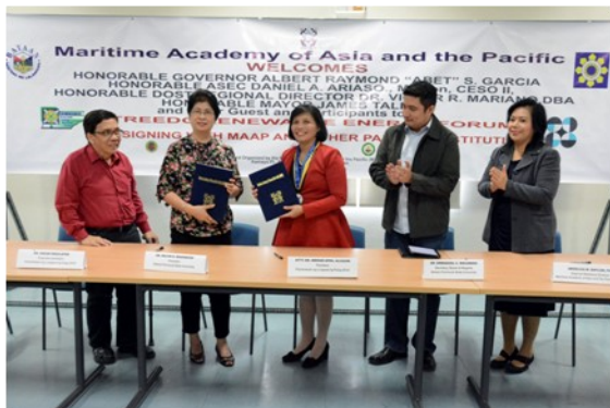
BPSU & PLP