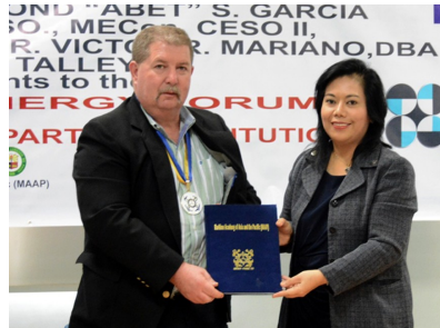
TREEDC & PAEPI