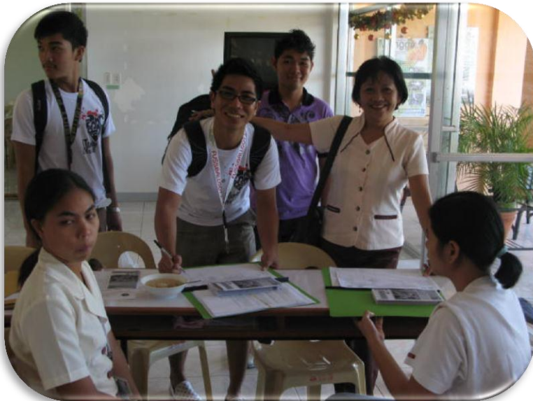
(left) Student leaders of the Bataan Peninsula State University was also invited to participate in the forum. The students play a vital role in executing extension programs of the university.